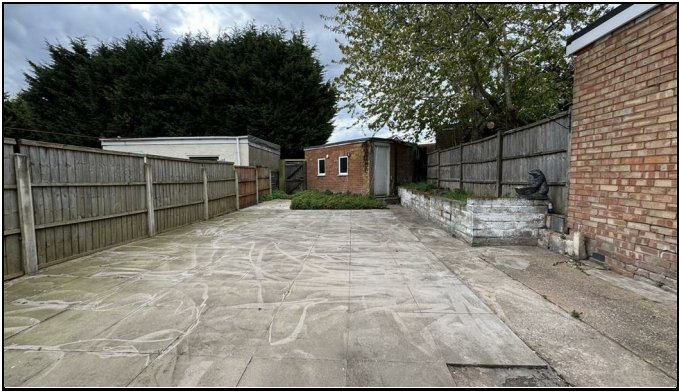
156 Elmbridge Road, Birmingham, B44 8AE